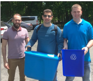
CAREERS recycling program