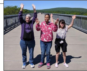
Hiking at the Mid-Hudson Bridge