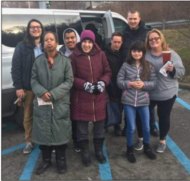
Christmas fun at the mall

AIM is a day habilitation without walls program that fills a void in the community for individuals not yet ready to participate in a supported work program. Tailored to their needs, interests and potential, the program provides diverse opportunities to interact and contribute to the local community, while learning independent living and employment skills. AIM participants do everything from shopping to landscaping to office tasks – providing volunteer support to the community while learning valuable life and work skills. Our AIM Program uses a person-centered approach and there are transportation options available. Services are provided free to participants and we offer both men's and women's groups and occasionally combine both for fun outings. If you know someone who is interested in joining one of our groups, e-mail careersforpeople@aol.com .