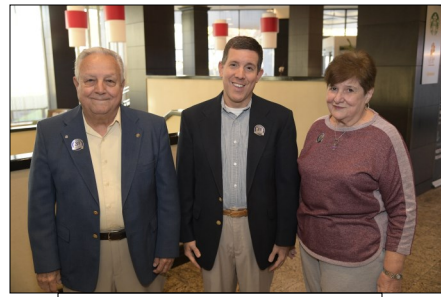
The Adimari Family