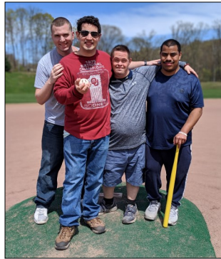
Playing wiffle ball